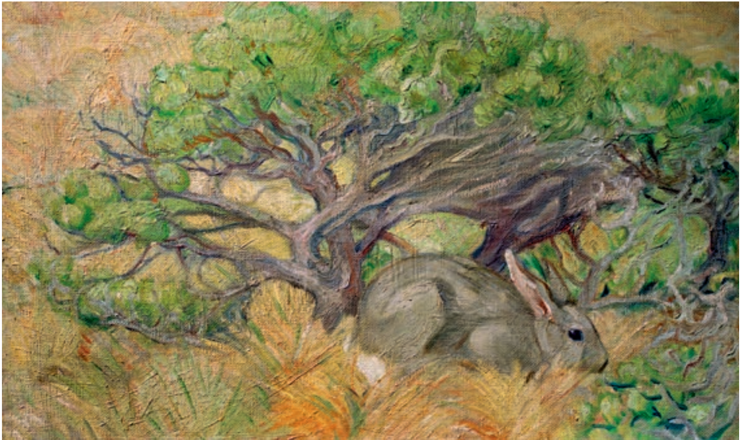
1 Franz Marc, WILD RABBIT, 1909