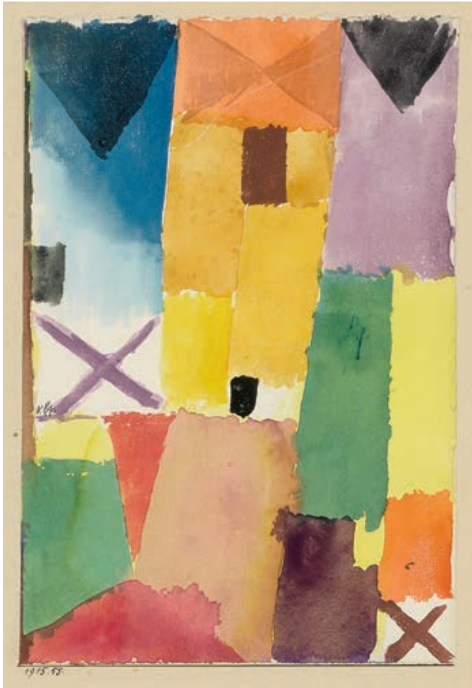
33 Paul Klee, YELLOW HOUSE, 1915