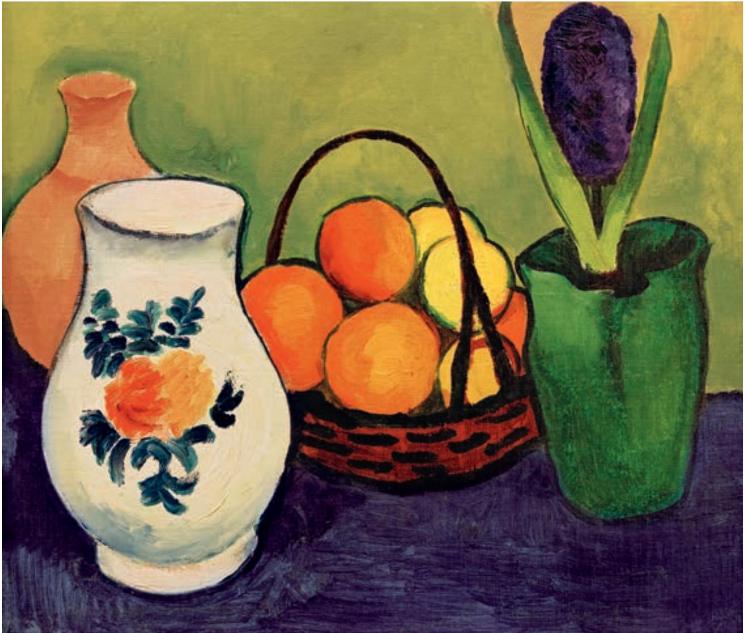
16 August Macke, WHITE JUG WITH FLOWERS AND FRUITS, 1910