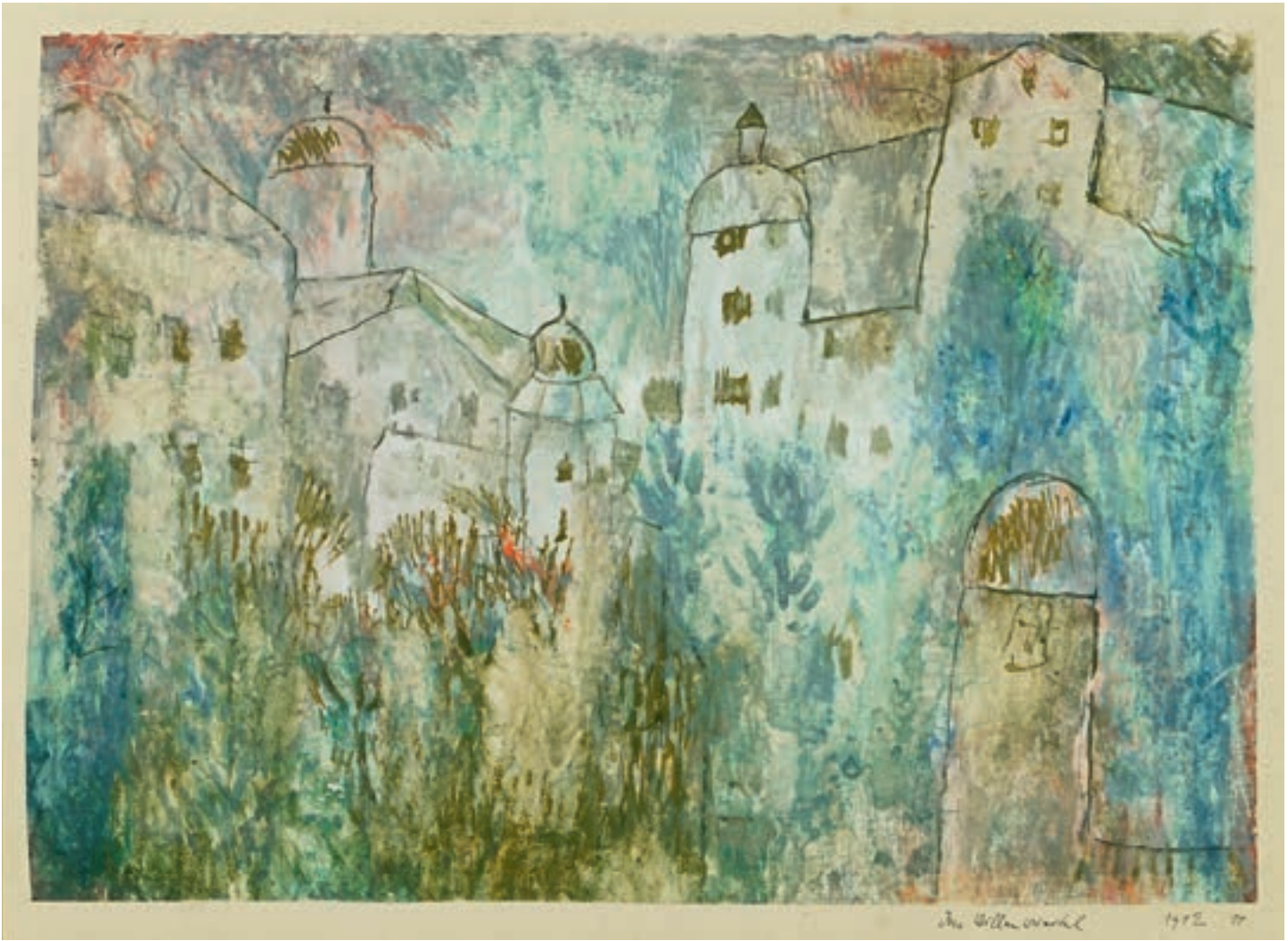
32 Paul Klee, IN THE RESIDENTIAL DISTRICT, 1912