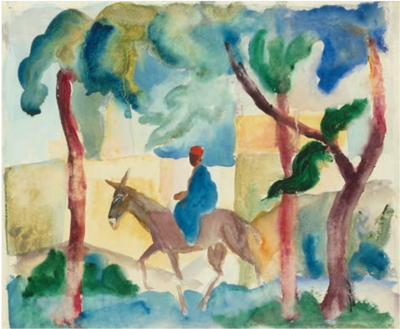
65 August Macke, DONKEY RIDER, 1914