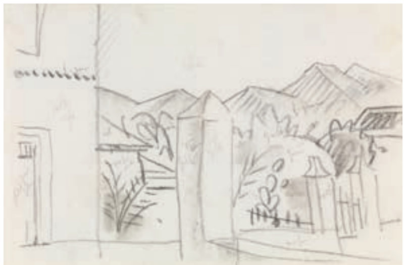
64 August Macke, VIEW OF THE MOUNTAINS (TUNIS), 1914