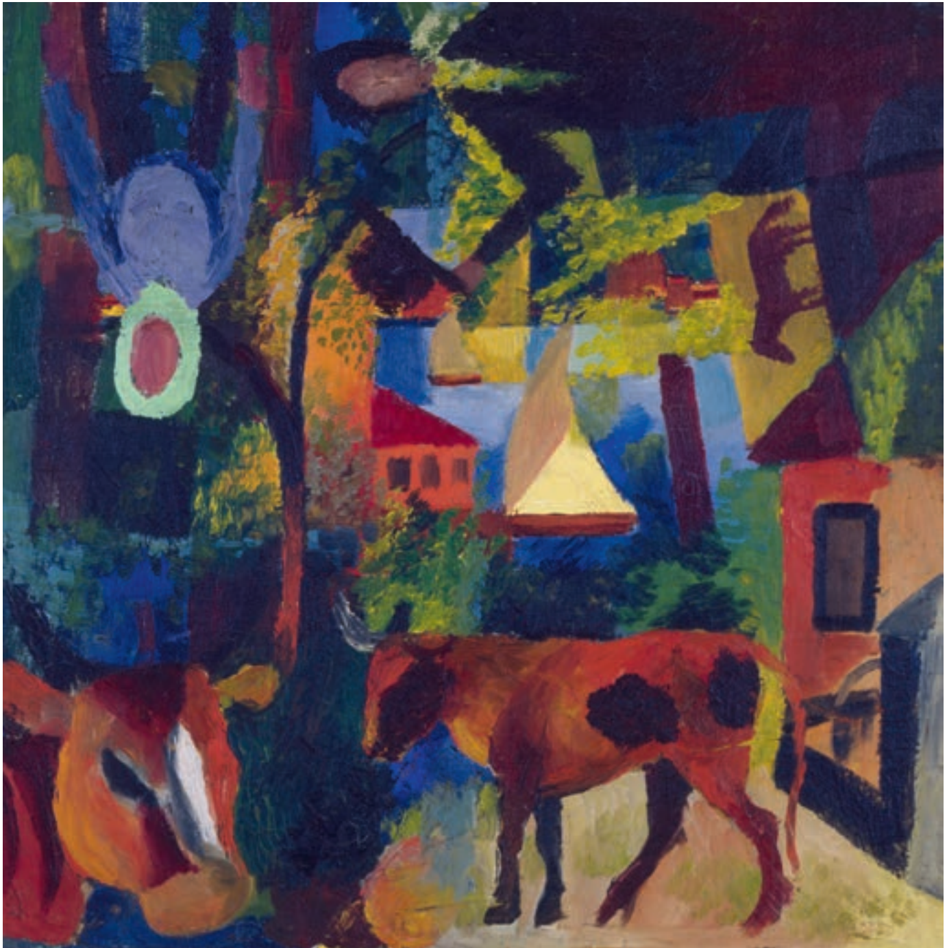
72 August Macke, LANDSCAPE WITH COWS, SAIL BOAT, AND FIGURES, 1914