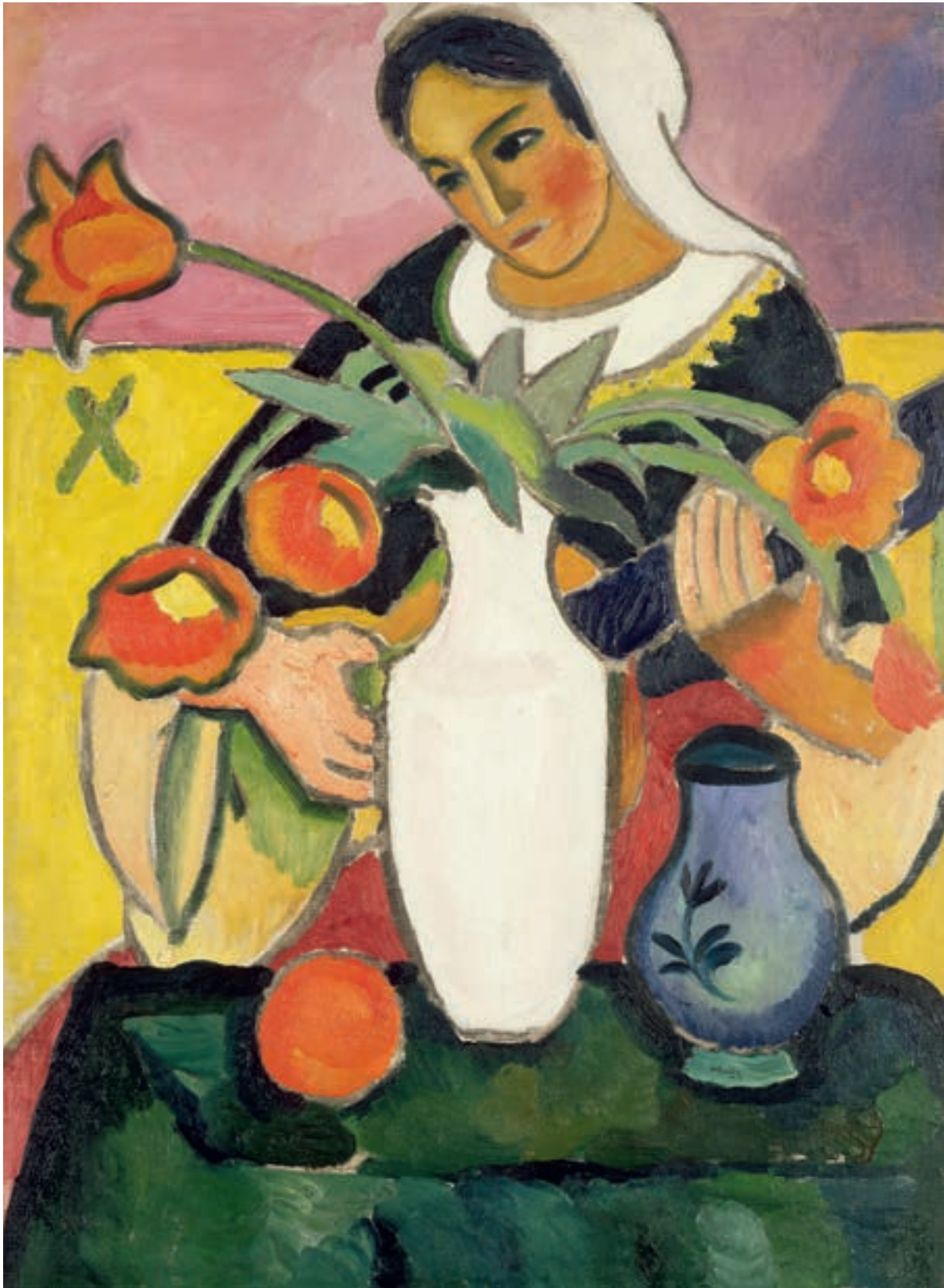
17 August Macke, WOMAN PLAYING THE LUTE, 1910