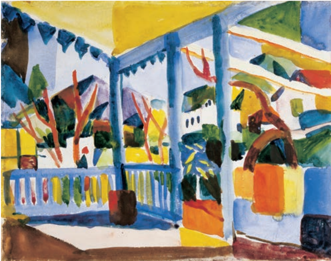
63 August Macke, TERRACE OF A COUNTRY HOUSE IN ST. GERMAIN, 1914