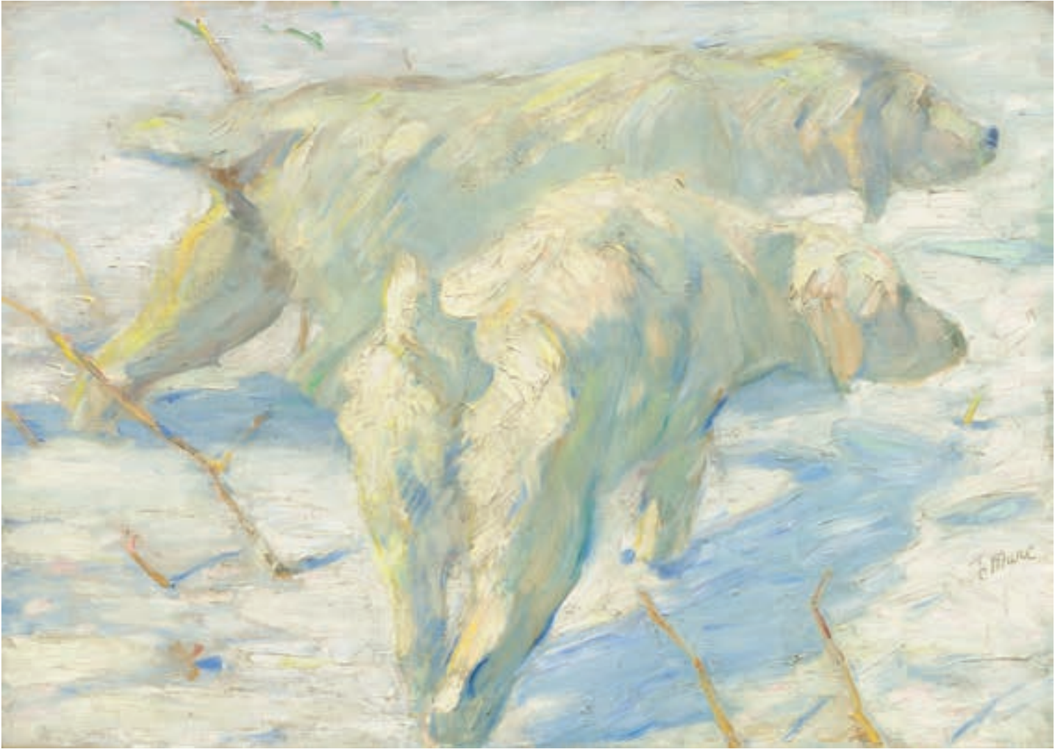
2 Franz Marc, SIBERIAN SHEEPDOGS, 1909