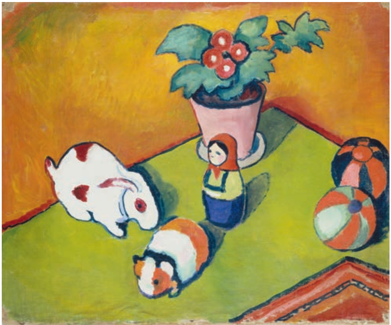
24 August Macke, LITTLE WALTER'S TOYS, 1912